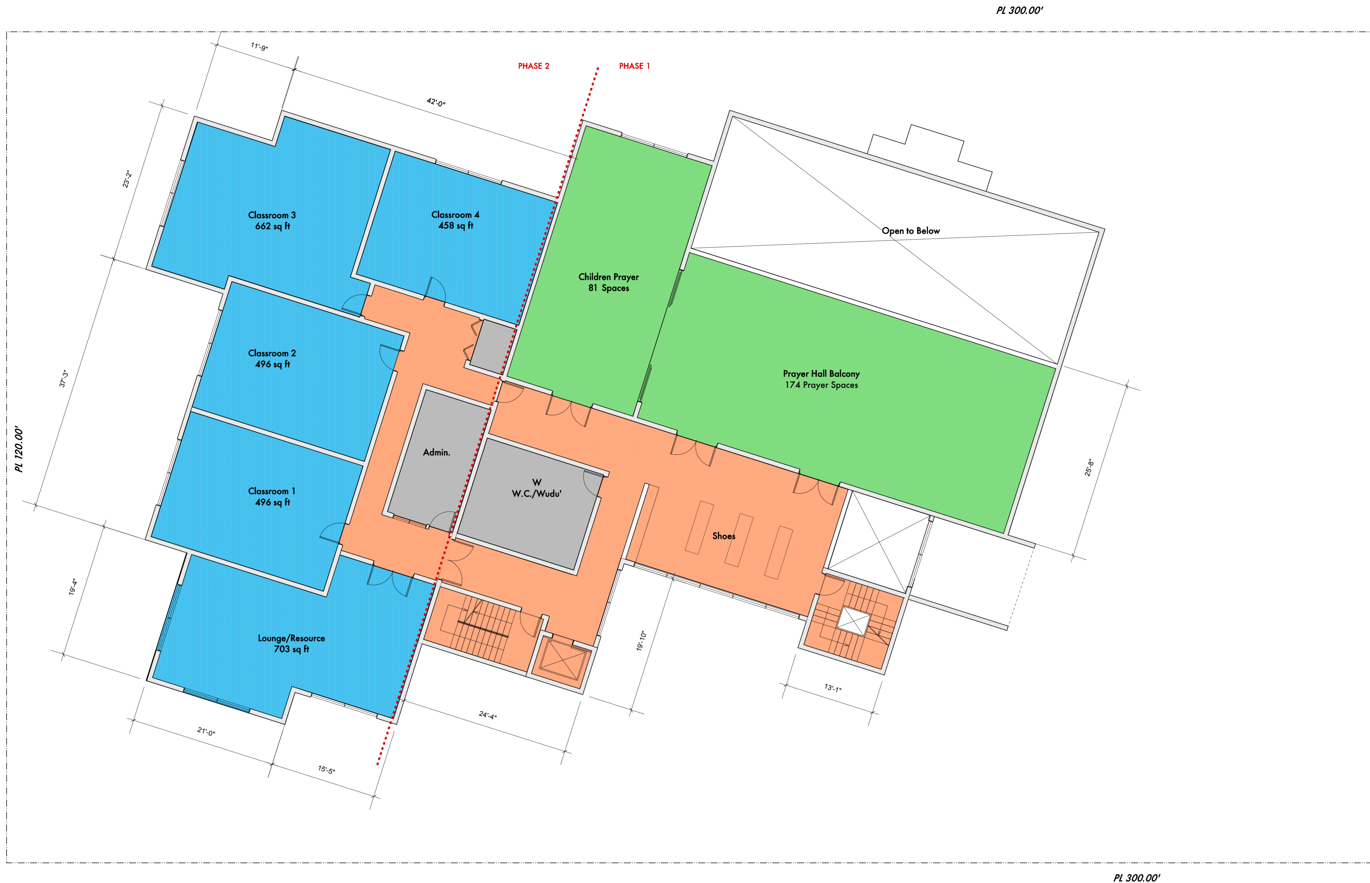
Upper Floor Plan Scale: 1/8" = 1'-0"