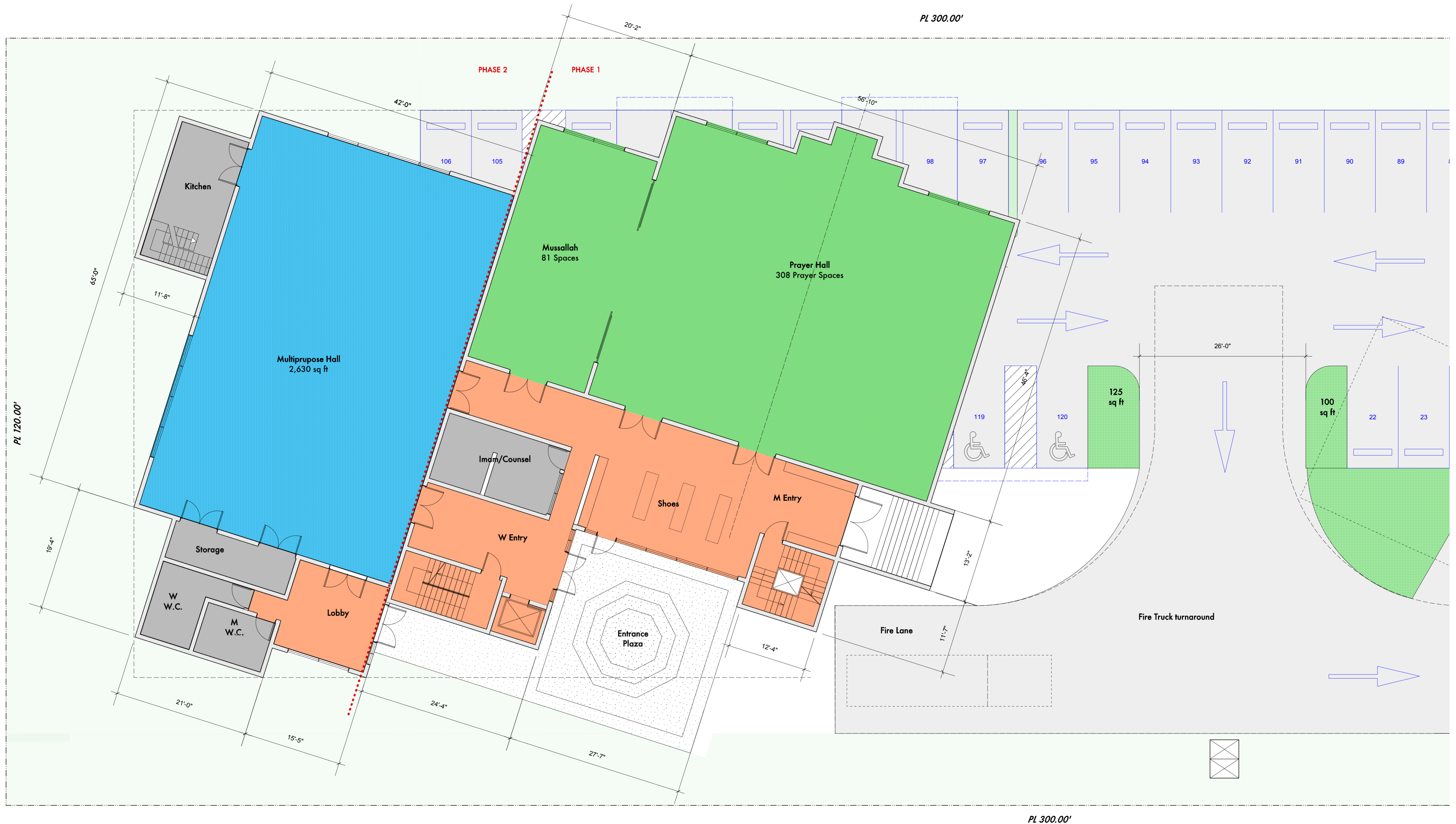
Main Floor Plan Scale: 1/8" = 1'-0"